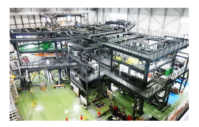
Figure 1. MRJ full-scale fatigue test setup.

Since the main objective of FSFT is no WFD substantiation, no artificial crack is introduced during FSFT. Therefore, damage tolerance evaluation (i.e. crack growth analysis validation) is separately conducted by sub-component level testing. For example, damage tolerance substantiation for fuselage structure was performed by using curved panel test facility (Figure 2). This facility can simulate the pressurization load with axial load and their loading sequence can be customized for each test. Major detail design points of fuselage structure such as the lap/butt-joint, cut-out structure and repaired structure are individually evaluated by this type of tests (Figure 3). Based on the test results, potential fatigue critical locations and crack growth behaviors are efficiently investigated, and they significantly contribute to the crack growth analysis validation necessary for CFR/CS 25.571 compliance.